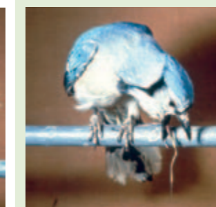
A naive Blue Jay is sick after eating a conspicuously-coloured monarch butterfly because it contains considerable quantities of defensive compounds (allelochemicals). The next time it encounters a monarch butterfly the bird will remember ....