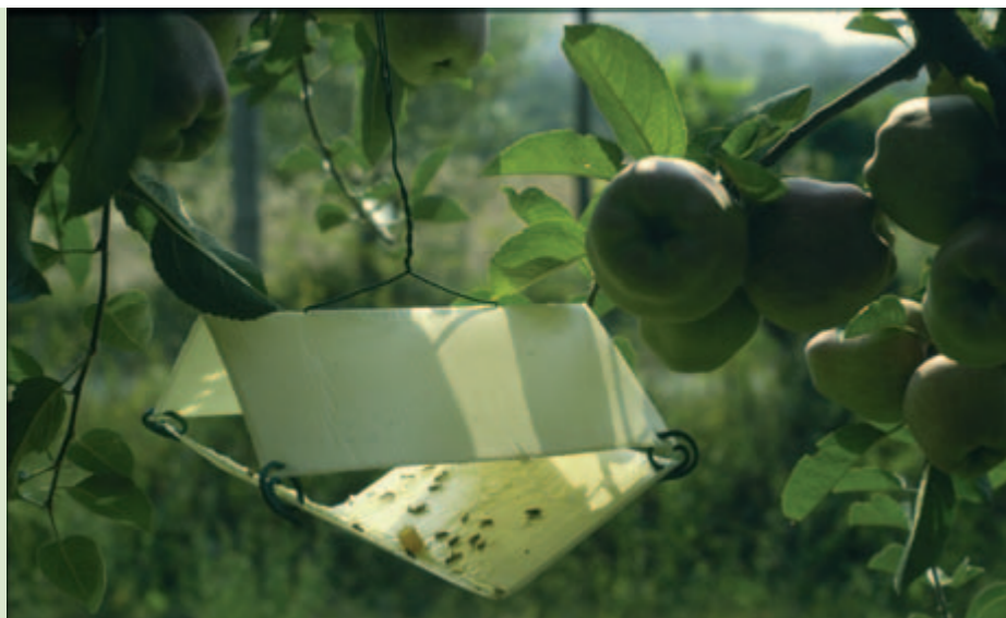
Sticky trap with sex pheromone dispenser (centre) to monitor population dynamics of the codling moth. Some trapped males can already be seen.