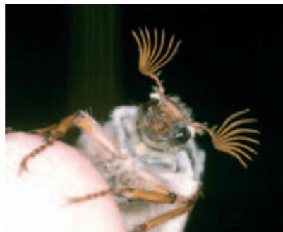
A cockchafer attentively spreads its feelers (antennae) to detect scents (signals) from members of its own species or plants.