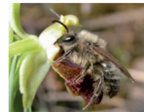
Attempt by a male bee to copulate with a flower ("pseudo copulation") which attracted him to pollinate it by imitating the scent of the female bee.

special glands, and the biologically active compounds, similar to the cosmetic formulation of a perfume, are embedded in a matrix of attendant substances such as solvents, fixatives or stabilisers.