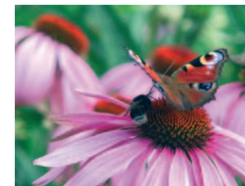
Peaceful (?) coexistence of a peacock butterfly and a bumble bee on a flower – in reality they are competing for food.

a completely different, microscopically small level. Here the female ovum seems to guide the male sperm with a seductive violet odour to then block entry to stragglers with a deterrent substance. This discovery could be used in developing natural contraceptives which confuse the sperm in the hunt for their target.