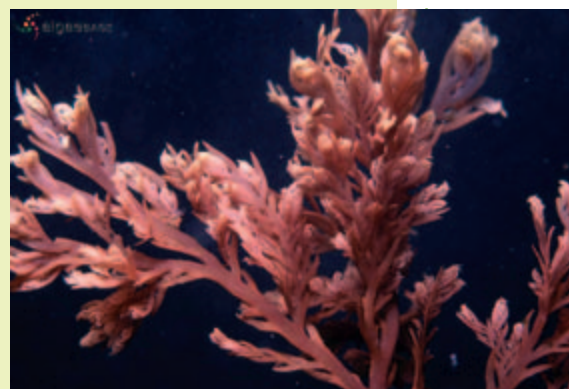
The red alga Plocamium rigidum

Unicellular algae that are the most important photosynthetic active organisms in the oceans.