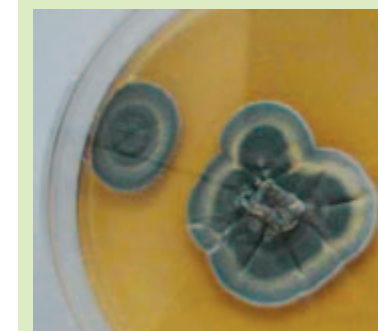
Many filamentous fungi produce important drugs like, e.g. penicillin.